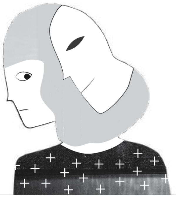
<sup>14</sup> If you have the printed version of this guide, all the documents are available on the Regroupement's website at the following address: <u>www.https://maisons-femmes.qc.ca/publications/boite-a-outils-comprendre-reperer-et-intervenirface-au-controle-coercitif/</u>